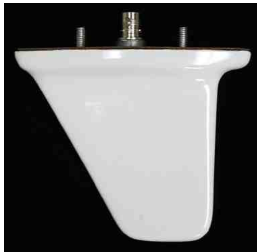
Blade or Fin antenna

There are basically three types of antennas, two of which require a ground plane (typically, a 6"-12" diameter thin metal sheet), and an internally mounted type that doesn't require a ground plane.