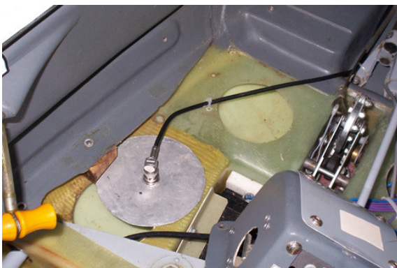
Rod antenna and ground plane mounted under thigh area

Good access to the mounting area will make it easier to route the coaxial cable and install the ground plane, if required. The actual "bolting on" of the antenna is easy once these are done. Mounting it in the front of the cockpit is easy, but exposes the pilot to more RF radiation (the position of the ground plane helps in this case) and the battery in this glider partially shields the antenna from receiving/sending signals towards the right side.