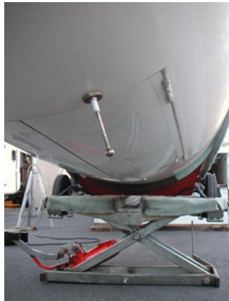
Rod antenna behind gear

A bottom-mounted antenna can be placed in the upward curve of the fuselage a short distance behind the landing gear doors, which allows most gliders to avoid these problems. A rod style antenna will bend before causing damage to the fuselage, but the stiffer fin/blade style probably won't. Some pilots make the bottom-mounted rod style antenna easily removable, but then there is the possibility of forgetting to attach it (the transponder won't work, of course, and the transponder could be damaged).