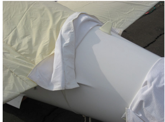
Blade antenna just behind wing

Good access to the mounting area will make it easier to route the coaxial cable and install the ground plane, if required. The actual "bolting on" of the antenna is easy once these are done. Mounting it in the front of the cockpit is easy, but exposes the pilot to more RF radiation (the position of the ground plane helps in this case) and the battery in this glider partially shields the antenna from receiving/sending signals towards the right side.