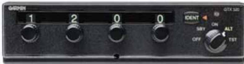
Garmin GTX-320A and similar units

“Airplane” units by Bendix, Garmin, Narco, etc, are generally too big and too power-hungry to be desirable, and the cheaper units don’t have the encoder readout and other features of the new designs. Specifications for the Garmin (pictured)