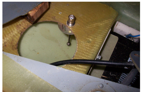
Ground plane removed from antenna

Contact your dealer or manufacturer first, as the antenna problem may already be solved; next, ask other owners of your model of glider locally or on an owners newsgroup. A posting on the newsgroups (rec.aviation.soaring and others) will often bring a solution. If you do come up with a good solution, please pass it on to your dealer for the next pilot!